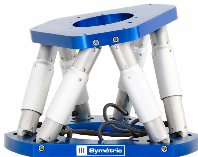
PUNA hexapod in motion