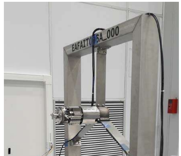
MAUKA hexapod has a very small diameter of 107 mm.